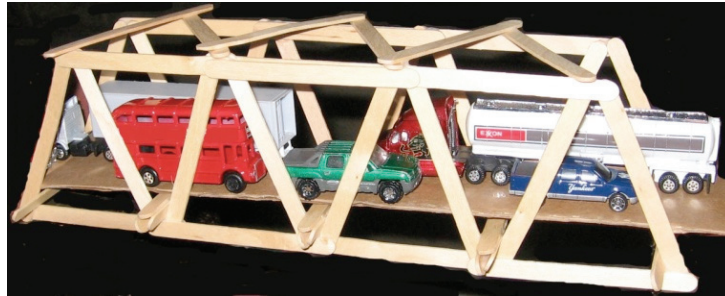
Figure 2. Truss bridge problem.

The hierarchical structure in the Truss Bridge Problem guided us in developing instructions for problems with similar structures. This structure also provided a coding scheme to rate the quality of task developed by the students.